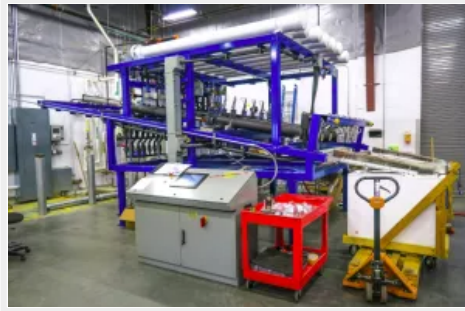
IBHS conducts hail research in the Laboratory Building for Small Tests, where hailstones of various sizes are recreated and propelled against roof samples.

For more than a decade, ERA leadership has supported research about factors that contribute to the resilience of EPDM as a membrane, and how it best functions in various roofing systems. More recently, ERA has invested in site-visits to leading research organizations that generate science-based data about resiliency in building systems, first to Oak Ridge National Laboratories, near Knoxville, Tennessee, and then to the National Research Energy Laboratories (NREL) in Golden, Colorado. Given the complementary goals of ERA and IBHS to help support the creation of truly resilient buildings, ERA leadership welcomed the opportunity to visit the South Carolina research facility.