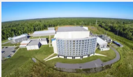
The Insurance Institute for Business and Home Safety Research Center evaluates construction materials and systems in its state-of-the-art testing laboratories.

JANUARY 17, 2018 BY LOUISA HART LEAVE A COMMENT