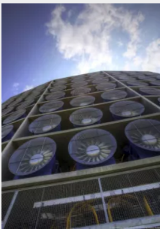
The IBHS Research Center's super-sized fans can recreate winds to measure their effects on full-scale one- and two-story residential and commercial buildings.

The hail research at IBHS was of special interest to ERA, given ERA's research that has consistently shown that EPDM membrane offers exceptionally strong resistance against hail damage. Based on field and test data sponsored by ERA, EPDM roof membranes outperform other roof systems in terms of hail protection. In 2007, ERA conducted tests which showed that EPDM roofing membranes did not suffer membrane damage and avoided leaking problems endemic to other roofing surfaces in similar circumstances. Of the 81 targets installed for that research over different surfaces, 76 did not fail when impacted with hail ice balls up to three inches in diameter. Perhaps most importantly, the impact resistance of both field-aged and heat-aged membranes in this test also clearly demonstrated that EPDM retains the bulk of its impact resistance as it ages.