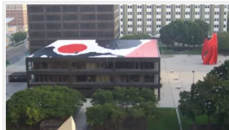
Great Lakes Systems, Jenison, Mich., was challenged to recreate the Calder mural on a new EPDM roof after tearing off the modified bitumen roof on which the mural was originally painted.