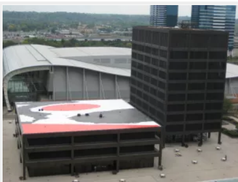
Artist Alexander Calder created the 127-square-foot red, black and white mural painted on the roof of the Kent County Administration building.